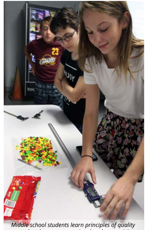
Middle school students learn principles of quality control and measurement in a hands-on activity.